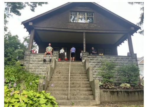
(Above) One group of visitors with the “Revive Us Again” group pauses for a picture on the porch of the Billy Sunday Home. (Above) Several Winona Lake residents watch the Independence Day parade from the porch of the Billy Sunday Home. See Page 2 for more pictures of these events.