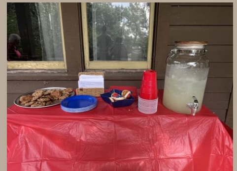
(Left) "Revive Us Again" participants tour the Billy Sunday Home. (Right) Visitors watch the Winona Lake Independence Day parade from the Sunday Home front porch while enjoying refreshments.