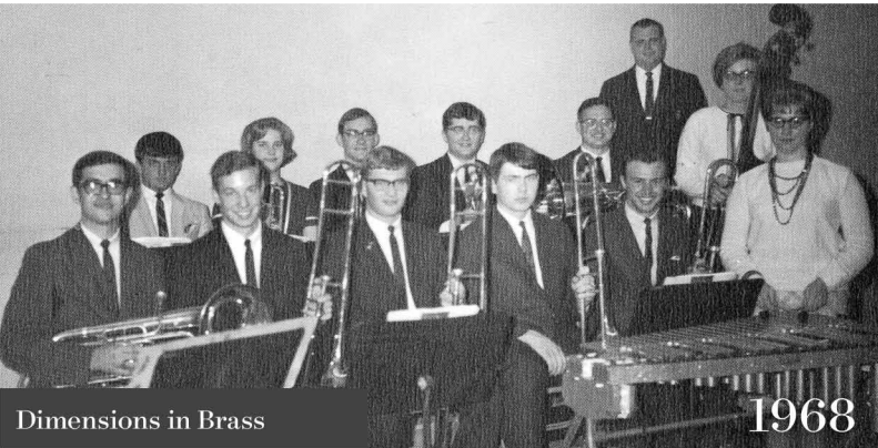
Dimensions in Brass