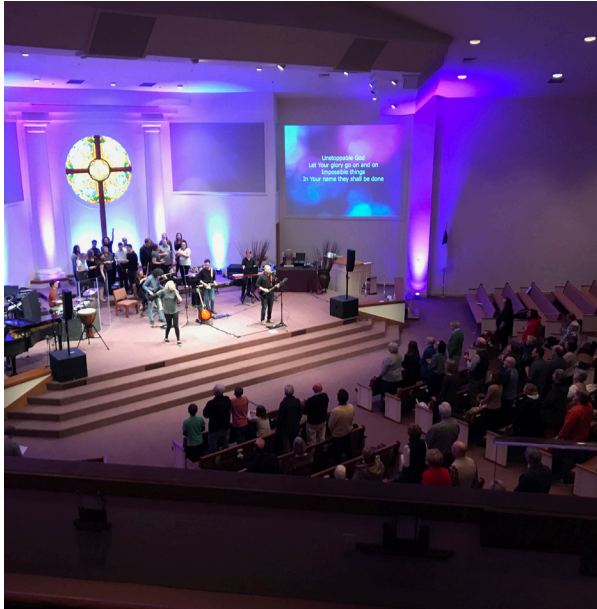
Students leading worship