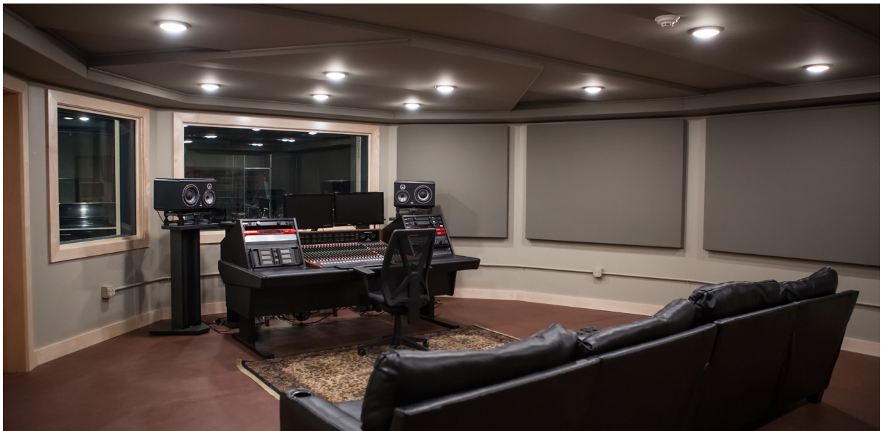
Students interested in music production are able to learn recording skills in our state-of-the-art facility.