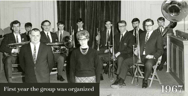
First year the group was organized